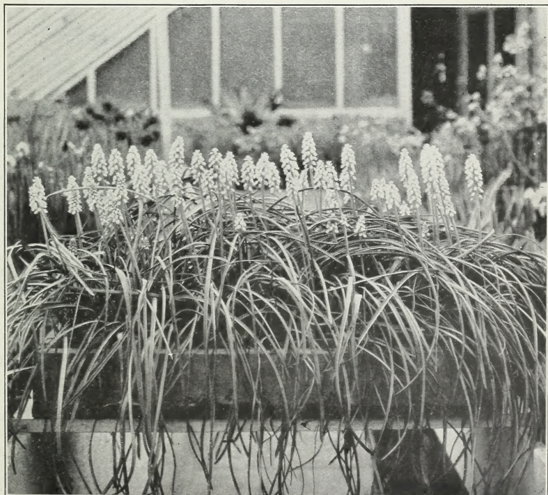
FIG. 2.—MUSCARI CONICUM GROWN FROM BULBS PRODUCED IN THE BEDS SHOWN IN FIGURE 1

These were grown under glass at the Arlington Experiment Farm, Va.